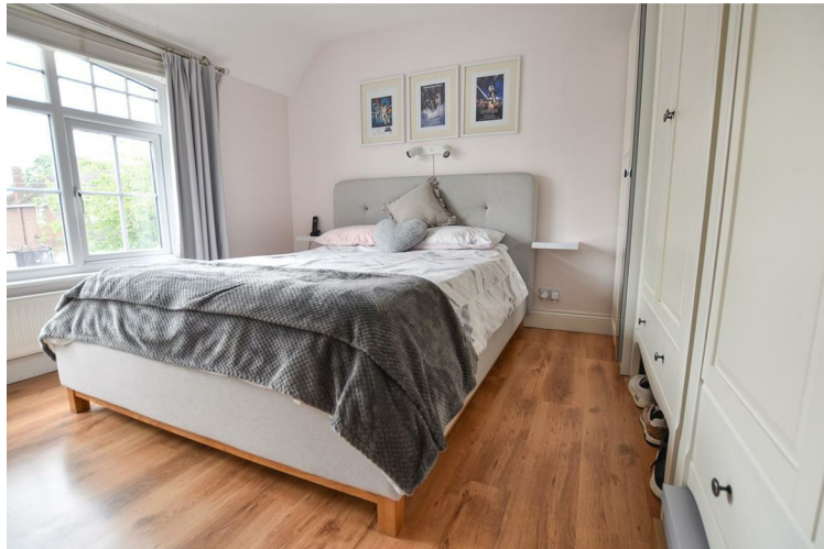
Bedroom 1 13' x 11'5 (3.96m x 3.48m)

Laminate wood flooring, smooth plastered ceiling Upvc double glazed window to front, radiator, air conditioning.