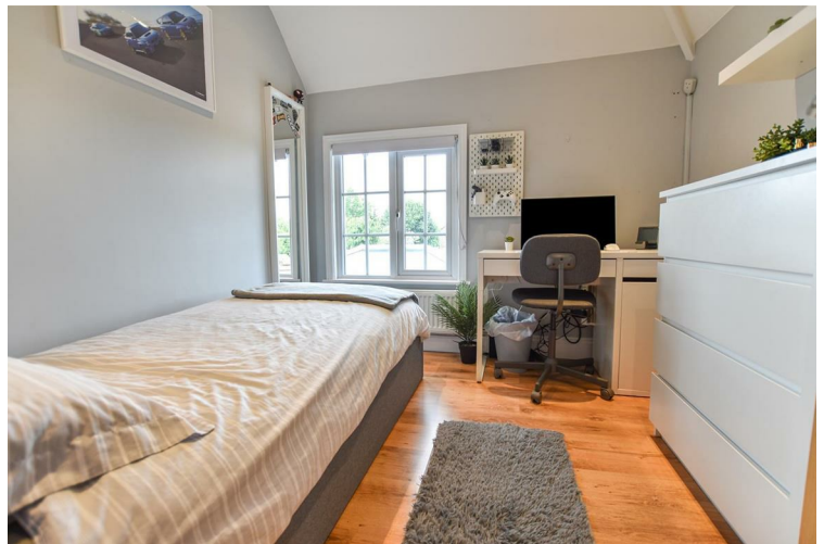
Bedroom 3 8'7 x 8'5 (2.62m x 2.57m)

Upvc double glazed window to rear, radiator, laminate wood flooring, air conditioning.